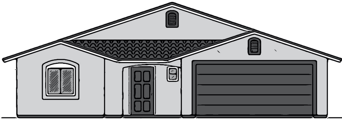
*Image color and texture for illustrative purposes only