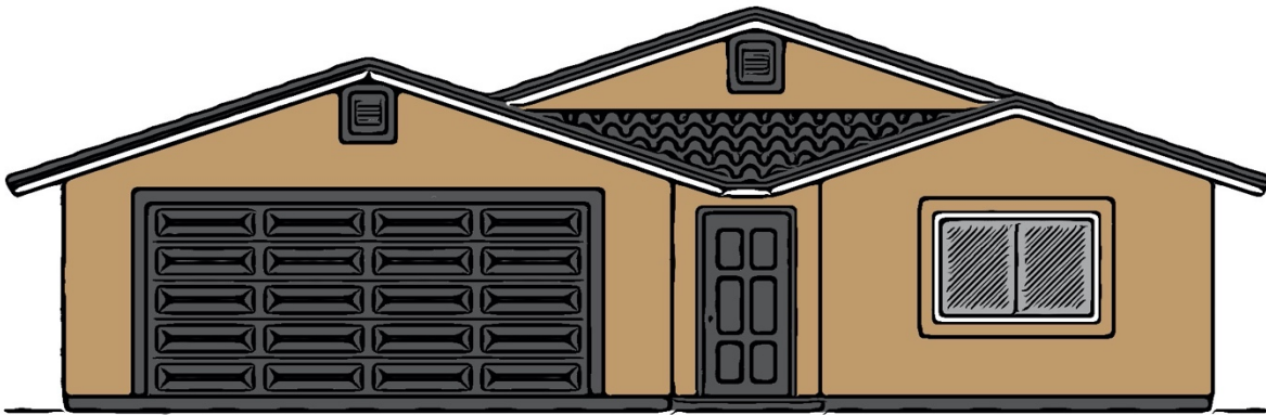
*Image color and texture for illustrative purposes only