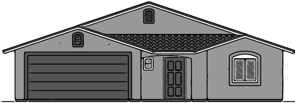
*Image color and texture for illustrative purposes only