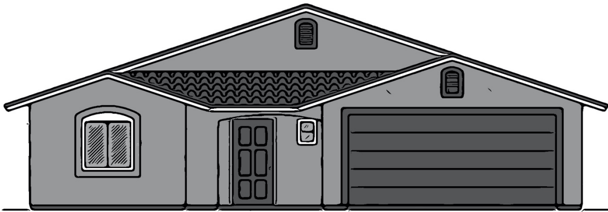
*Image color and texture for illustrative purposes only